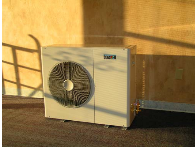
13 Seer Horizontal Condensing Unit

Today, EspiTech sells high-velocity indoor air moving systems, 13 SEER Horizontal Condensing units and all the accessories for these lines.