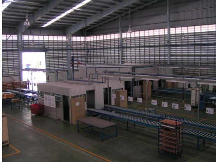
Flow Manufacturing Lines with Leak Detection

The Rayong, Thailand facility produces all of the equipment on new assembly lines. All lines incorporate Product on Demand Technology and can produce products in batches of one. This manufacturing technology has many quality assurance checks and balances to ensure all the products are manufactured and tested according to the specified requirements of Engineering. All line workers have pictured tasks of the work performed and of the quality checks they must perform on the prior workers tasks.