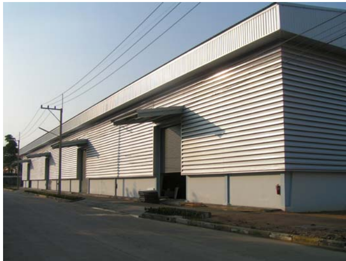
Rayong, Thailand Facility

All of the Velocity Plus duct system and many of the accessories are produced in our Chesterfield, Mo. Location.