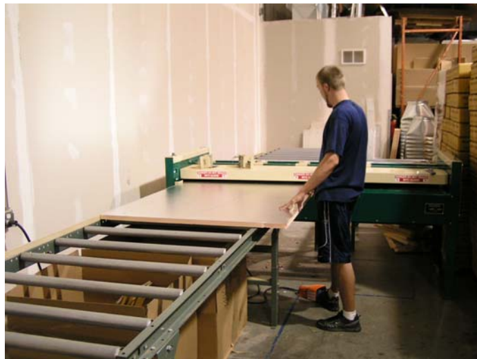
Koolduct Grooving Machine, Chesterfield

Our Chesterfield location manufactures and assembles the duct system for the Velocity Plus Line. These products include Air Distribution Centers, Return Air Kits, Secondary Drain Kits, and others. All Air Distribution Centers are manufactured using R8.5 Koolduct, phenolic board. The board is grooved and assembled according to UL standards and makes for the only sealed duct system in the industry.