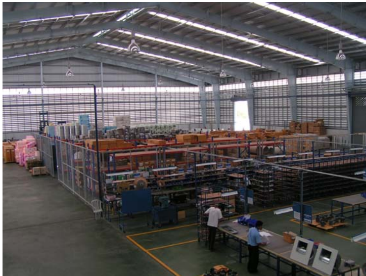
Warehouse and Shipping Area Rayong